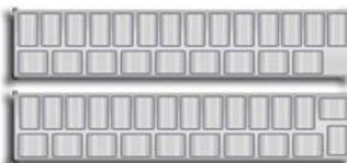
23 to 24 Europallets 800 x 1200