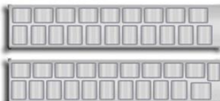
20 to 21 Standard Pallets 1000 x 1200