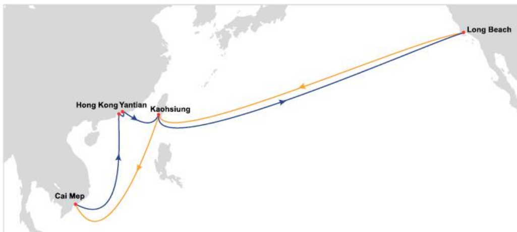
Pacific Vietnam China South (PVCS)

The PVCS remains an OOCL core product operating within the Ocean Alliance partnership offering competitive transit times and access to the Long Beach Container Terminal (LBCT). LBCT is a leader in providing increased efficiencies through innovation and technology as well as protecting the environment and safety of employees.