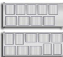
9 - 10 Standard Pallets 1000 x 1200