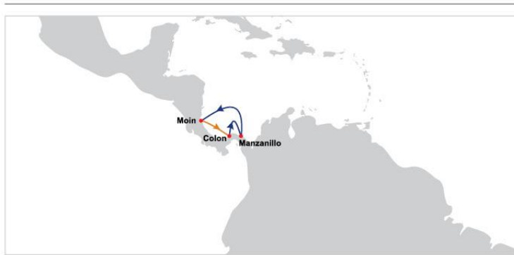
Caribbean Express 1 (CX1- Moín Loop)

For more information about these enhancements and services, please contact your local sales representative.